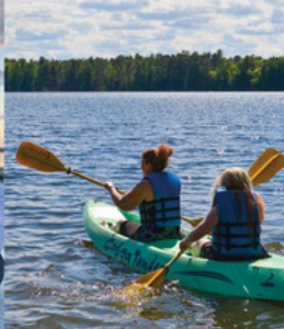
Moon Beach St. Germain, WI