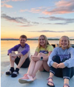
Daycholah Center Ripon, WI

Event registration is open! Go to ucci.org