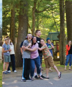
Camp AweSum Supporting Youth on the Autism Spectrum and their Families

Our congregation is fortunate to have three different church camp locations to camp at and retreat to as part of the United Church Camps in the state of Wisconsin. Daycholah Center, Moon Beach, and Cedar Valley are outdoor ministry programs associated with the United Church of Christ, the Wisconsin Conference of the UCC, and Outdoor Ministry Association UCC.