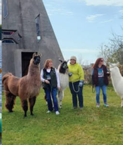
Cedar Valley West Bend, WI